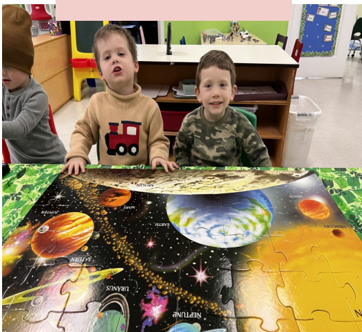
Solar System Puzzle