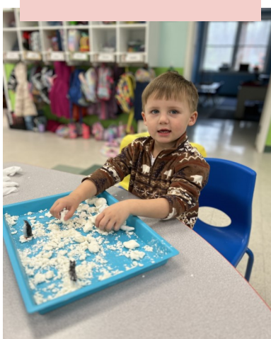
Artic Animal Play