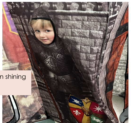
Sully as our knight in shining armor!