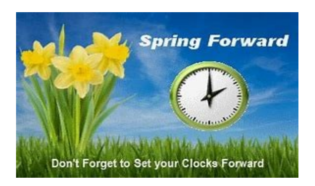
Daylight savings time begins March 9.