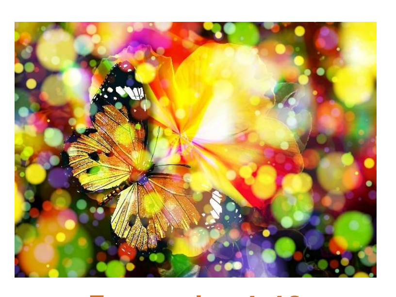
For grades 1-12

St. Peter's United Methodist Church 15599 Mountain Road Montpelier, Va. 23192 (804) 883-5596