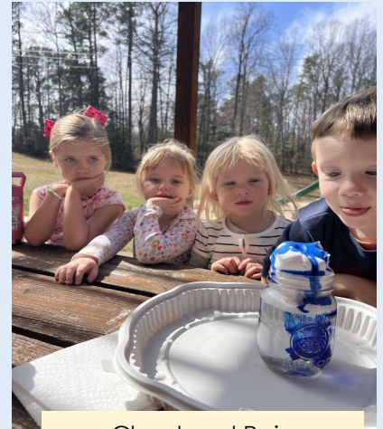
Cloud and Rain Experiment

Life around the Pond - Discovering the world above, around, and in the pond