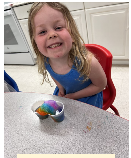
Mixing colors to make a rainbow.