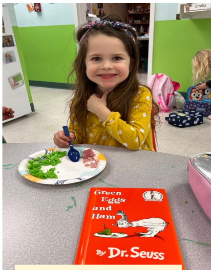
Eating Green Eggs with Ham!

We appreciate your ongoing support and look forward to a month filled with growth, exploration, and joy! As always, feel free to reach out with any questions or concerns.