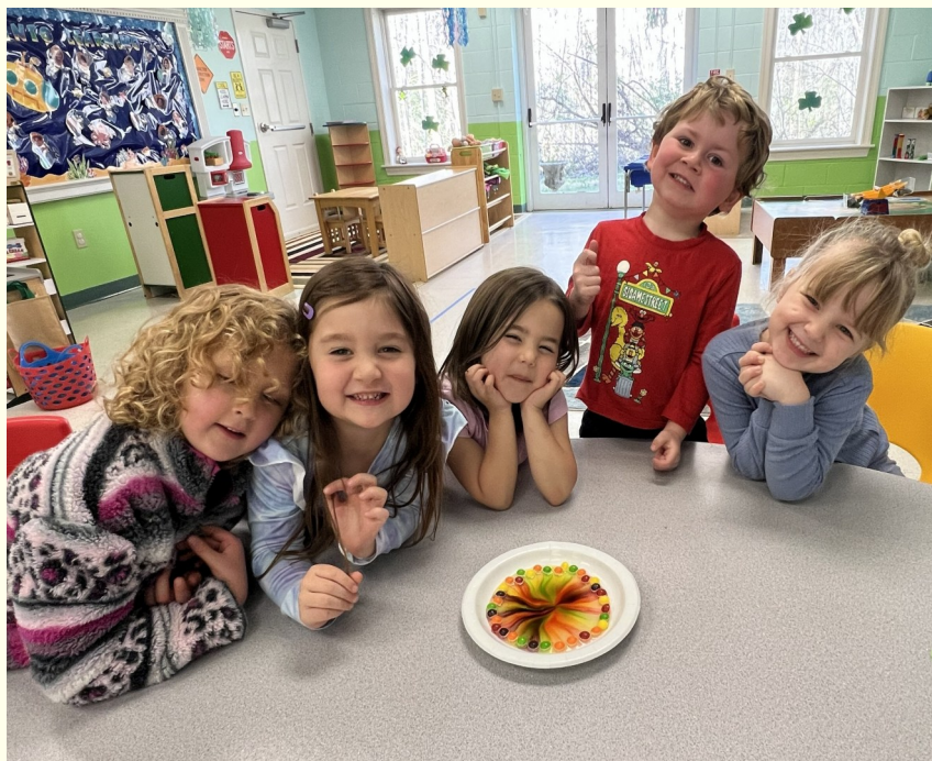
Skittles Rainbow Science Experiment