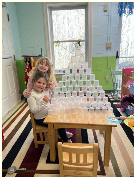
Team work at its finest!

Thank you for being part of our preschool family. We are so proud of all the children and love seeing their excitement for learning each day. We are looking forward to a wonderful April together!